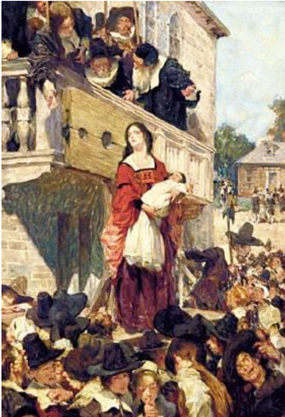
Figure 1: Picture of Hester Prynne and her daughter being punished by public humiliation