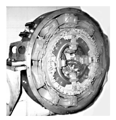
Fig. 1. BE-59/7-10

device under the sudden voltage alteration on the excited synchronous machine.