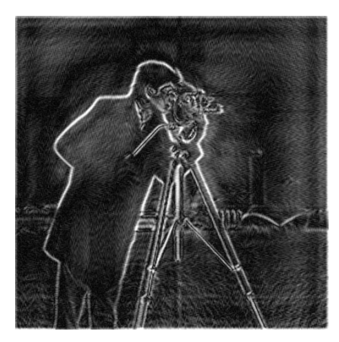
Figure 5. Initial image is processed by DOG wavelet.