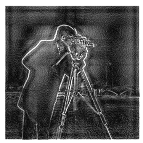
Figure 6. Initial image is processed by WAVE wavelet.