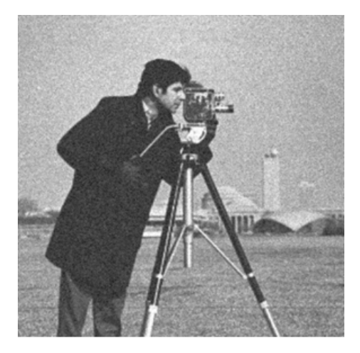
Figure 3. Initial image with standard deviation \sigma=30 .