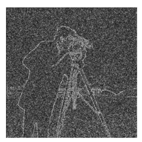
Figure 4. Initial image is processed by Sobel operator.