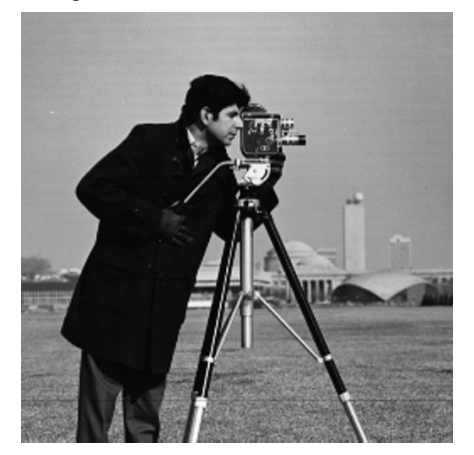
Figure 1. Initial image (8-bit).

See Fig. 3 for the image with RMSD at \sigma =30. For the results of edge extraction by the known Sobel method see Fig. 4. See Fig. 5÷7 for the research of the proposed algorithms of edge extraction by the use of DOG, WAVE and MATH wavelets at noise background for the models with the mathematical noise expectation m0=0. See Tables 1-3 for the values of e<sub>rmsd</sub>, SNR1 and SNR2 for the series of the studied test images.