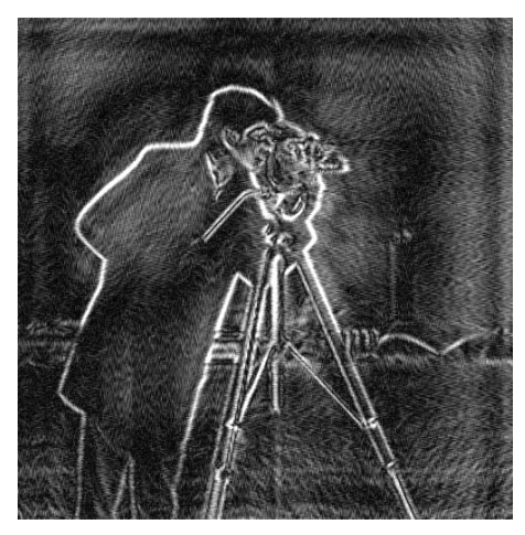
Figure 7. Initial image is processed by MATH wavelet.