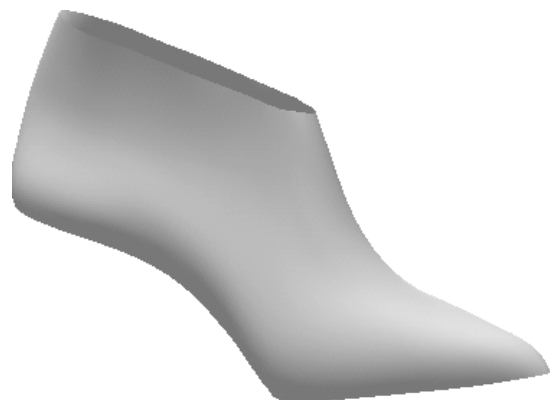
Rendered Image of the Shoe Figure 4

Fig. 3 shows the input data, which was generated by the company's non-rational bisectic Bezier-based modelling package, and Fig. 4 shows a rendered image generated from it.