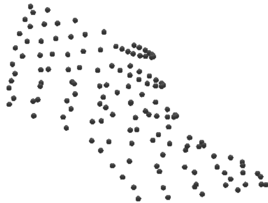
Data Used to Define the Shoe Figure 3

Figures 3 and 4 illustrate the application of the point-based method to modelling a shoe. The data was kindly supplied by C & J Clark International, an industrial collaborator.