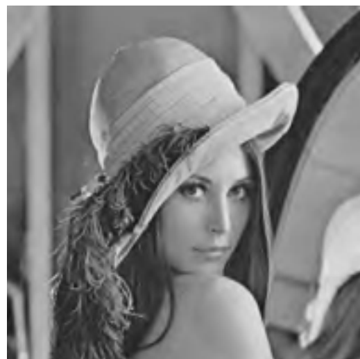
Figure 4 Reconstructed Lena images at bit rate 0.125 bits/pixel. SPIHT (left) and RPSWS (right)