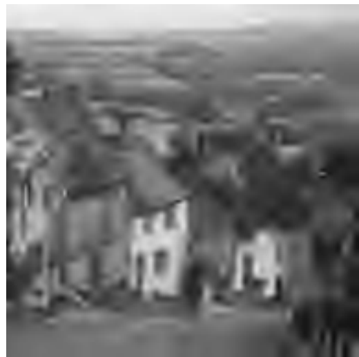
Figure 6 Reconstructed Goldhill images at bit rates 1, 0.125, and 0.015625 bits/pixel respectively. SPIHT (left) and RPSWS (right)