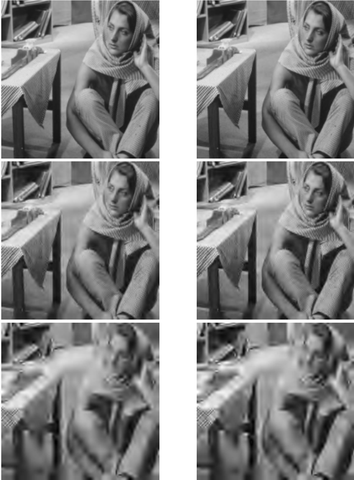
Figure 5 Reconstructed Barbara images at bit rates 1, 0.125, and 0.015625 bits/pixel respectively. SPIHT (left) and RPSWS (right)