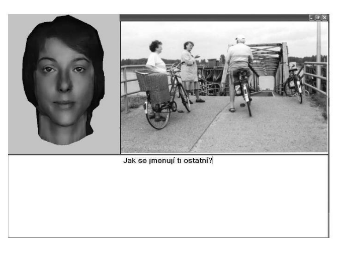
Figure 3 Snapshot of the presenter

In Figure 3, there is shown a snapshot of the screen which was presented to the object as a visual communication interface of the dialogue system. On the left upper part of the screen,