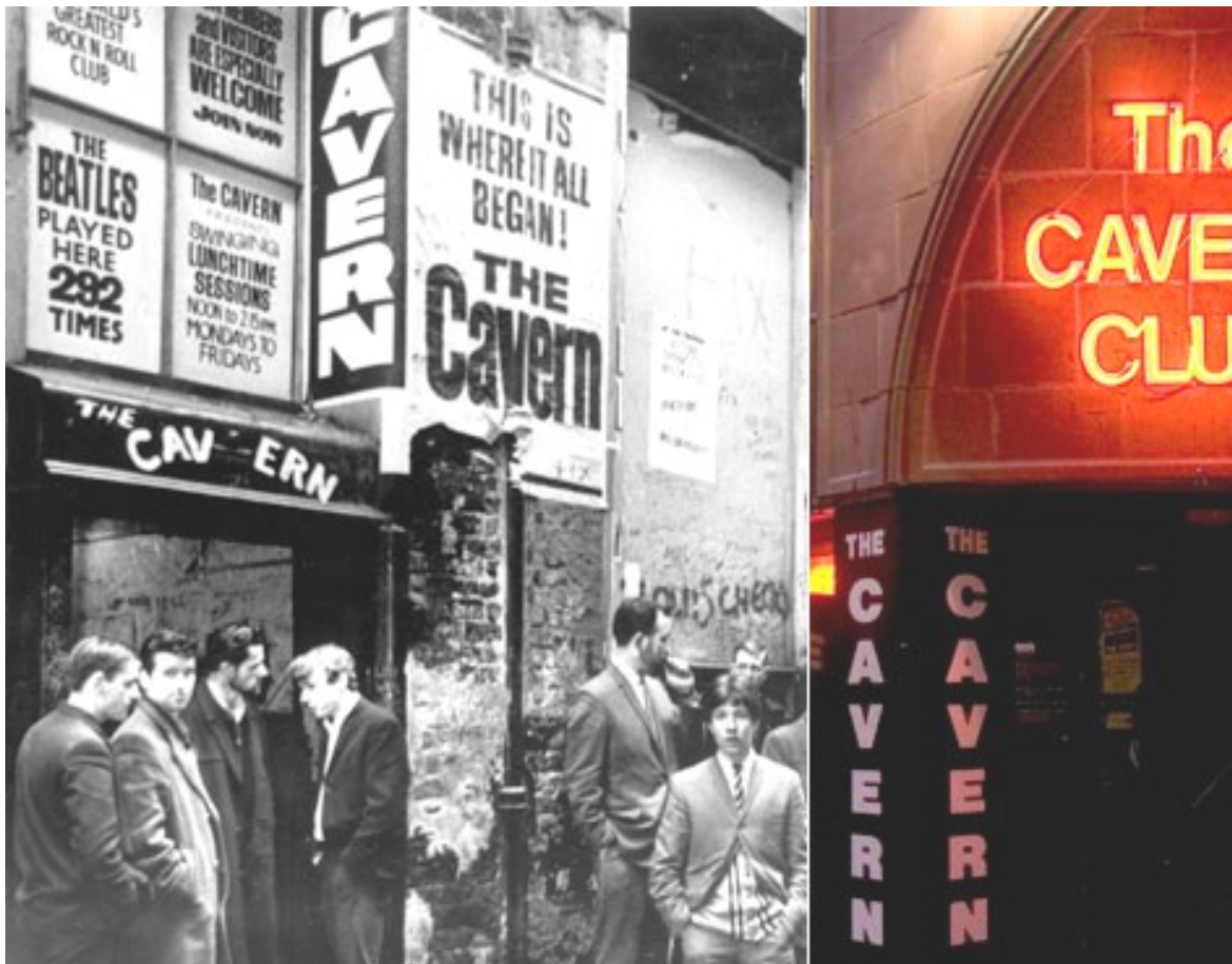
Fig.2: Left – the original entrance at the old location. Right – the new reconstructed entrance across the street from the old location.