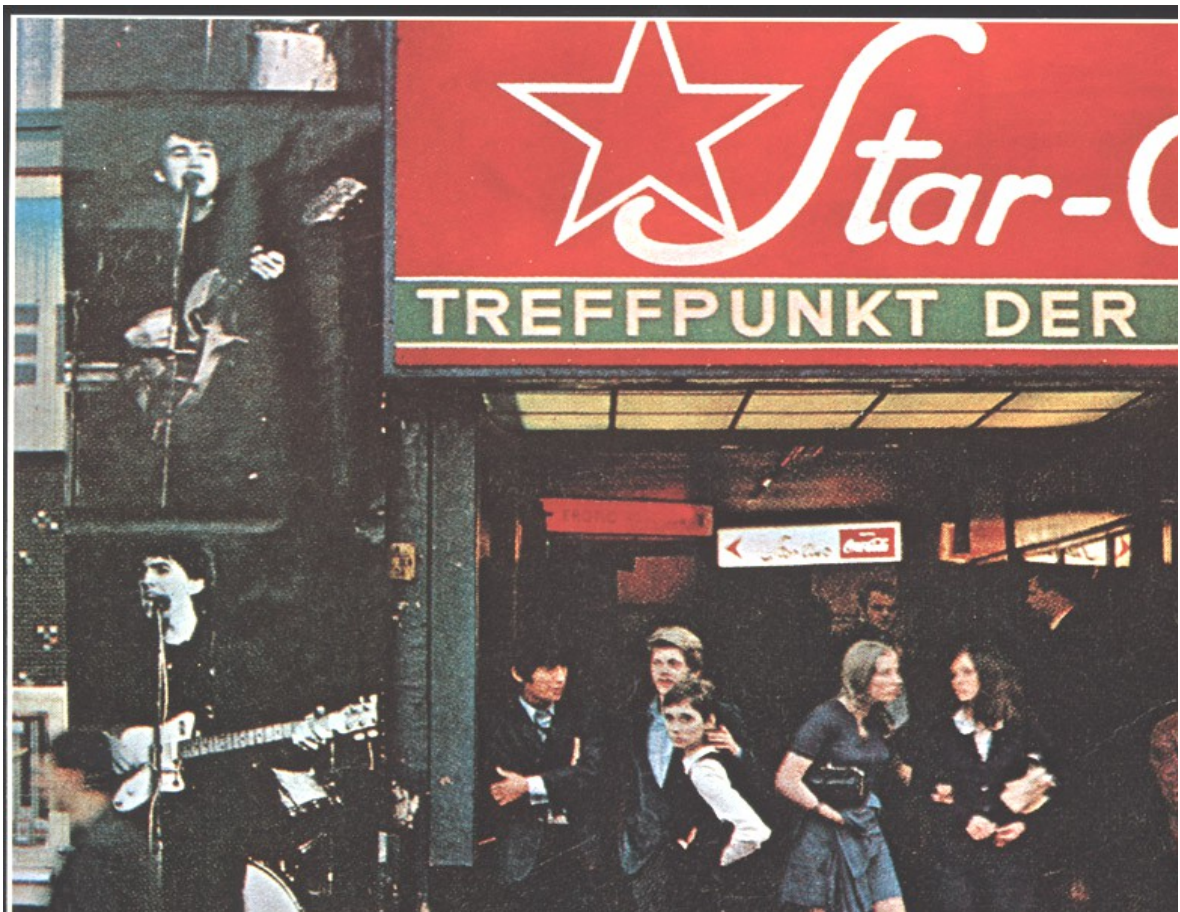
Fig.3: Star-Club – one of the main meeting points of musicians and fans in Hamburg during the 1960s.

Meanwhile the fabulous Star-Club (see Fig.3), opened in 1962 at Hamburg's Große Freiheit Straße 39 (in the same street as not less famous Kaiserkeller Club), regularly hosted ones of the biggest pop and rock giants ever, as The Beatles, Tony Sheridan, Frank Zappa, the Liverbirds, The Tremors, The Rattles, Jimi Hendrix, Carlos Santana, Joe Cocker, Eric Burdon, Black Sabbath (known as Erarth), Cream, The Searchers, Soft Machines, Gerry and The Peacemakers, Jerry Lee Lewis (one of his live albums was recorded at Star-Club), Ray Charles and Bill Haley. [15]