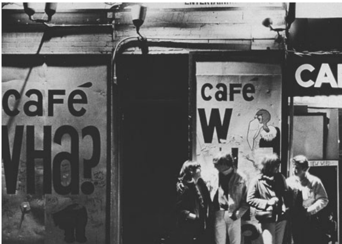
Fig.1: Cafe Wha? – the name was shortened from Cafe What? to advise incredulity.

It would not be too much to call Cafe Wha? (see Fig.1) in the Greenwich Village of New York City a “birthplace” of the kings of music. Bob Dylan is said to play here for a burger and place to sleep after his arriving to New York; at that time an anonymous Johnny Allen Hendrix (later Jimi Hendrix) was discovered here by the Animals bass player Chas Chandler; and it was also here where “the Boss” Bruce Springsteen earned his first money with the earlier band the Castiles. Nevertheless Cafe Wha? was a “home” for many famous personalities, such as the actor and filmmaker Woody Allen, comedians Richard Pryor and Lenny Bruce, the Beatnik Allen Ginsberg. It is surprising, that such a small corner in New York City gathered up so many people, whose contributions with lion’s share have changed the global history of the music.