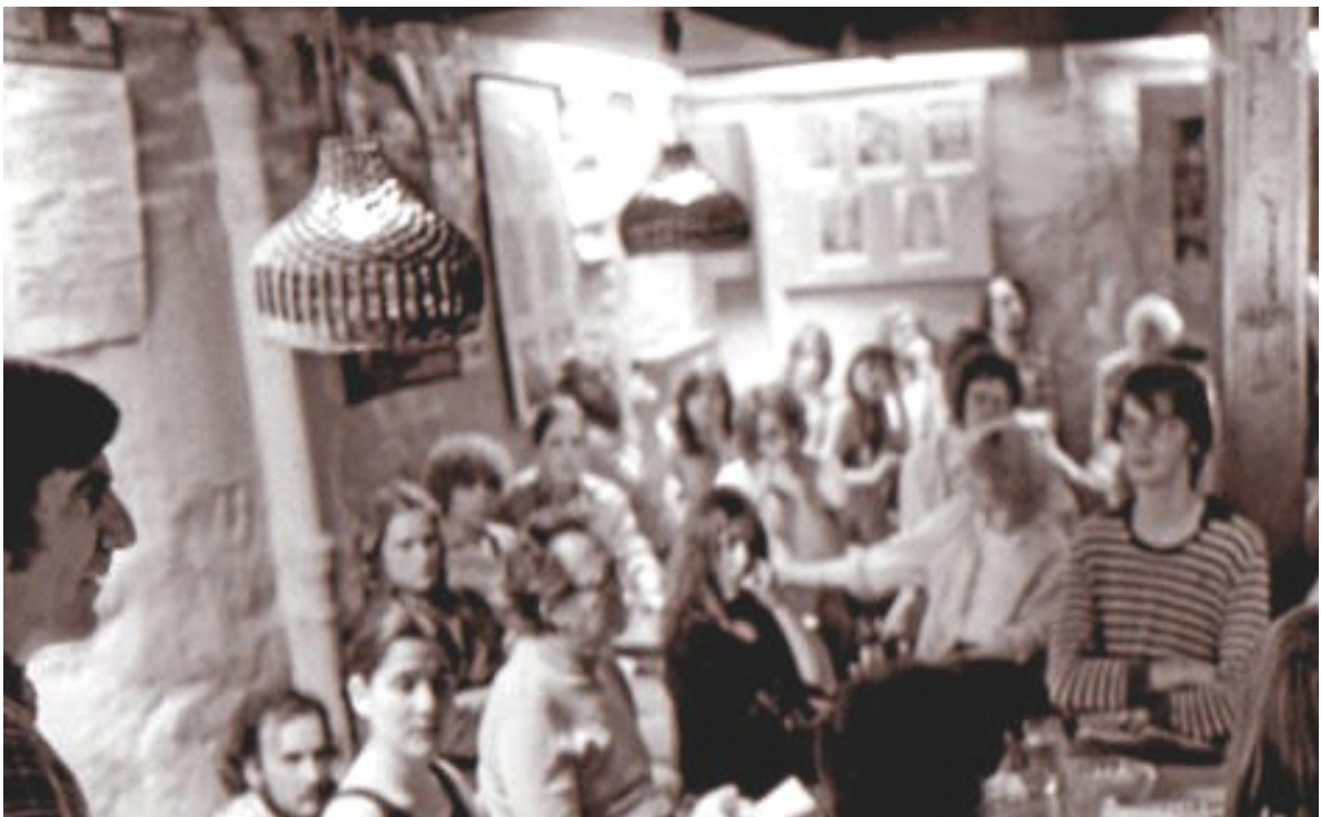
Fig.4: Rudi Dutschke (left) talking to the crowd in Club Voltaire. He played a leader role in the West German student revolution of the Sixties. Source: http://www.fnp.de/lokales/frankfurt/Frankfurter-Club-Voltaire-erhaelt-SPD-Kulturpreis;art675,754766

A breaking new club concept was born in Club Voltaire (see Fig.4), where the doors opened first time in 1962 in Frankfurt. Beside common live music stages, it was the knot of present revolutionary political culture, offering art exhibitions, films, readings, discussions and political events. The revolutionary concept remains firmly until today and at the moment, the question of refugee crises is often discussed here. [16] The emerge of dance clubs from 1967 onwards set up a new way of enjoying music, by mixing psychedelic music and drugs together, for example Grünspan (Hamburg), Sound (Berlin) and Klub 27 (Copenhagen). The followers of this kind of discotheques formed a befogged political alliance of political opposition. [17]