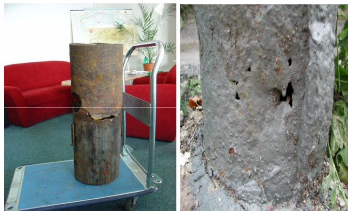
Fig. 1. Damaged lighting poles

The corrosive damage of the pole occurs usually at the pole base, often under the surface. The corrosion on the top of the pole is less frequent. In any case, the damage is not apparent and localizable (Fig. 1).