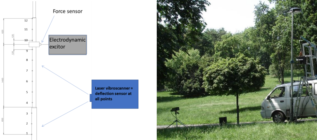
Fig. 2. Measurement setup for experimental modal analysis of lighting poles

The lighting pole is of a specific construction. On one hand, it is quite simple welded beam with few moving parts or screw connections that often introduce nonlinearities. On the other hand, the poles are usually fixed into the ground using the sand bed. The sand is a material with excellent damping properties; however, the properties are related to the humidity of the sand. So the modal damping is not stationary and also the damping measurement has low accuracy; thus, damping cannot be used as a measure of the pole health. The pole eigen frequencies and shapes were initially analysed based on FEM modelling. The FEM model of healthy pole fixed into the frame and the pole destroyed (one third hole of the diameter) were compared. Eigen frequency change was very small for lower frequency range up to 40Hz ( \Delta f cca 0.02-0.4 Hz). The change of eigen frequencies in higher frequency range (up to 250Hz) was more promising, although some differences were very small, some almost 3 Hz. But the pole deterioration cannot be judged based on observation of only one eigen frequency.