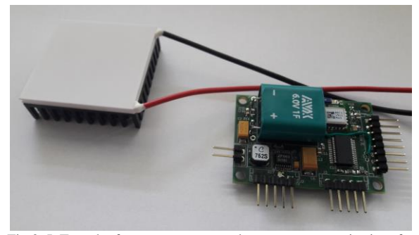
Fig.3 IoT node for temperature and movement monitoring for medical purposes

The device (see Fig.3) consists of one mainboard with central microcontroller and accelerometer, temperature sensor, Bluetooth module and storage capacitor. The Peltier cell is connected externally and allows change in size and power.