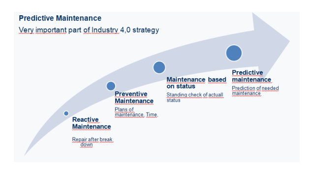
Fig. 5: Future in maintenance

It is no secret anymore, that some companies have already started implementation of first basic systems of Industry 4.0. Using components, which are able to send on-line data from its run, measuring and prediction of process data, preventive maintenance, use of augmented reality etc. Use of augmented reality, for example, is nowadays tested for education of maintenance personal.