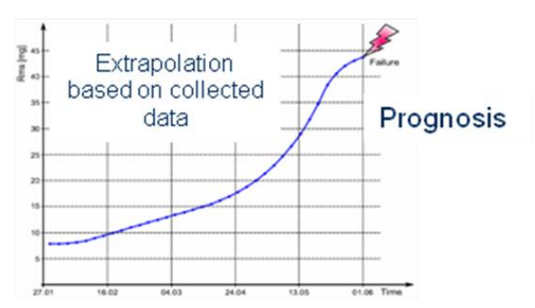
Fig.4 Prognosis of preventive intervention on machine

Of course, people are not able to work with so much data. It is task for artificial inteligency and self-teaching systems. First systems, using so called neuron-network, are allready working. We are on start position and have to do very hard job to bring this systems into real life and our industrial aplications.