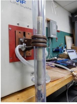
Fig. 2. Impeder test stand

While it would be preferable to run tests on a full production line, a much more controllable test stand was constructed to simulate these conditions. The stand can be seen in Fig. 2. The major components are a 25kW PPST induction power supply, a three-turn inductor, impeder casings, and SMC impeder cores. There are also a variety of sensors (Rogowski belt, voltage probe, thermocouples) for measuring electrical parameters of the inductor and inlet and outlet temperature of the cooling water.