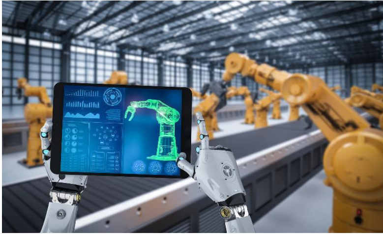
Figure 2 – Gather information in real-time showing on tablet [10]

Hereabouts, raises the question: “Is this still maintenance?” At the fair in Munich, the company Apple introduced a variety of smartphones and tablets configured for maintenance equipment. Known service provider Bilfinger introduced a new mobile information system and the concepts of data management for cloud-based solutions. Based on these arguments, it can be said that the Internet of Things (IoT) has walked into the world of maintenance. Visitors could take a picture by their mobile phones and tables and share images with colleagues and business partners in real-time.