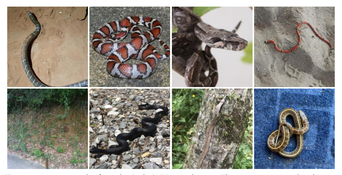
Figure 1: Image examples from the SnakeCLEF 2021 dataset. The images are resized and center cropped to 224 \times 224 .

In total, 386,006 images with annotations were provided. Training with external data was not allowed.