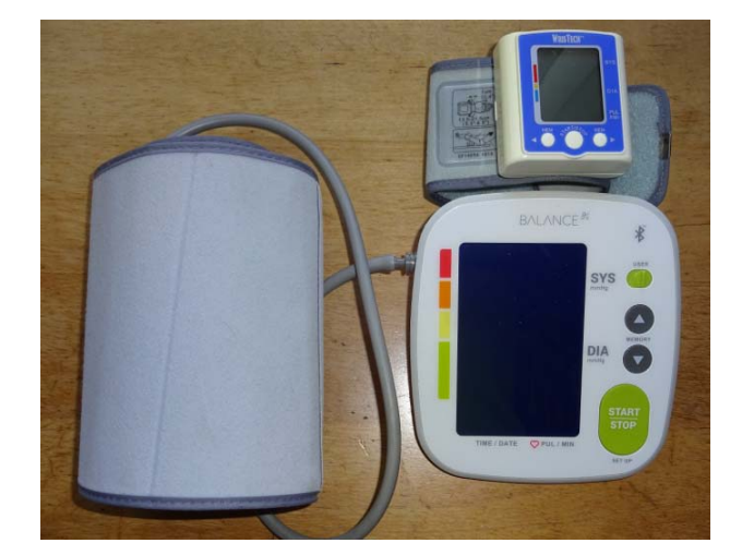
Fig. 1. Arm and wrist home BP monitors

High blood pressure (hypertension) is a world-wide health problem. Measurement of blood pressure (BP) is the most frequently performed health test. It belongs to the family of vital signs. BP measurement is increasingly performed in the home. Home BP monitoring provides useful information to the physician and to the patient [1]. Most recommended home monitors on the market are automatic, with an arm cuff. Wrist home monitors are also popular, but are usually not recommended by experts. The advantage of wrist monitors is small size, low power consumption, and they can usually be used even on very obese people. The disadvantage is that the wrist must be kept at the level of the heart during measurement. When the cuff is not at heart level the BP reading can be artificially higher (cuff below heart) or lower (cuff above heart). Fig. 1 shows a home arm monitor and a wrist monitor.