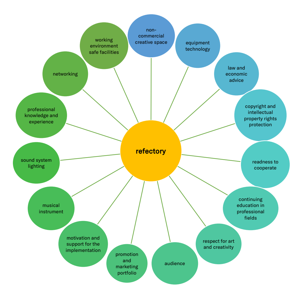
Model of Arts incubator: Jesuit college refectory in Klatovy

of the value of using such spaces for activating teaching methods with elements of the dual system of education. The outcome of the research process has produced an analysis of the relationships developed in the Refectory environment, depicted above (Model of Arts incubator: Jesuit college refectory in Klatovy). It was found that in the refectory, compared to a classical business incubator, additional sessions are needed for learning by doing systems to crystalllize. These have a direct link to the Faculty of Education's arts education in expressive disciplines and provide suitable facilities for learners. These are namely: