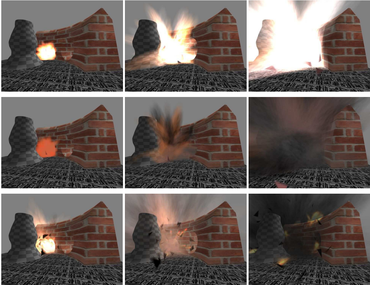
Figure 5: An explosion rendered with additive blending (top), normal transparency blending (middle) and controlled additive blending (bottom).

brighter than any single particle, but they will not result in white areas like with plain additive blending.