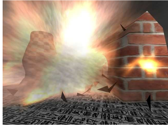
(b) Particles rendered with custom shading for soft clipping (28 fps).