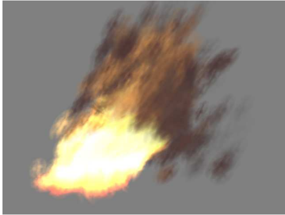
Figure 1: A fire effect. Individual fire and smoke particles are visible.