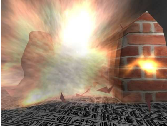
(a) Particles rendered with the default OpenGL pipeline. The intersection edges between particles and the brick wall are clearly visible (80 fps).